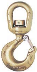
S-322CN / S-322AN